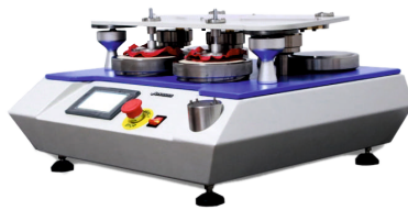
MARTINDALE ABRASION TESTER