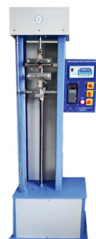
DIGITAL CSP/TENSILE STRENGTH TESTER