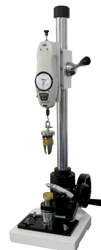
BUTTON SNAP PULL TESTER