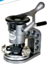
CUT & FIT GSM CUTTER